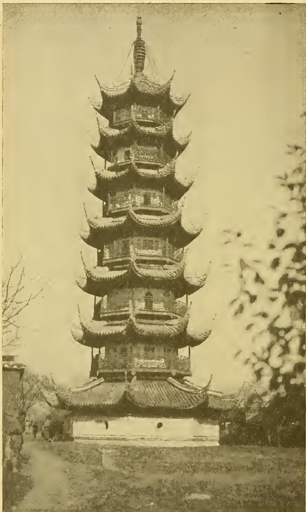
LOONG HWA PAGODA, NEAR SHANGHAI

her girlhood days, are drawing to a close." The principle doctrine being filial piety, there are special exhortations on her duties to her parents, -